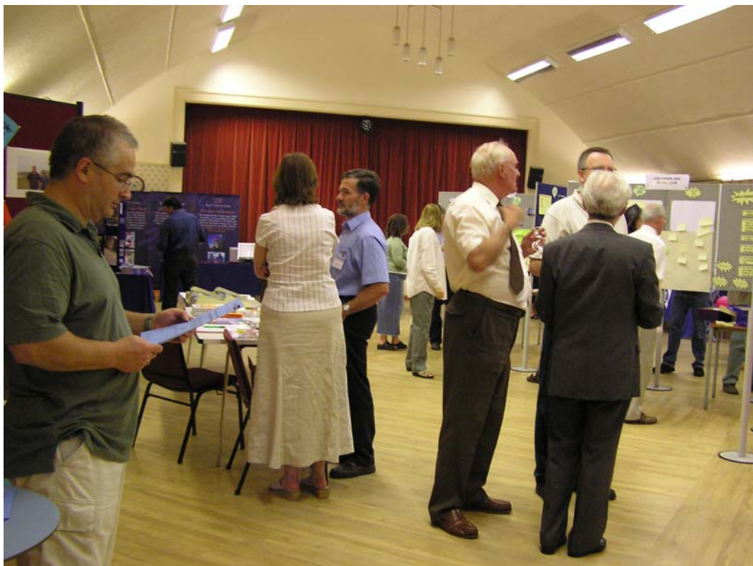
Consulting the community